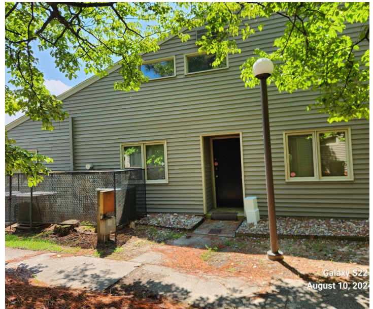
Galaxy S22 August 10, 2022

Investment opportunity is waiting. Currently leased with four years remaining, plus option to renew. Current Net CAP 9.5% +/- . Tenant pays HOA dues which covers building outside walls and roof, Grounds maintenance and Water/sewer. New Owner would be responsible for inside property insurance and property taxes. (included in Net CAP) This Medical or Multi Use office space is close to Cape Fear Valley Hospital and is across the street from the Fayetteville Ambulatory Center. Majority of offices in the Metro Medical Complex area are medical or professional. The building has eleven first floor rooms. Set up with four exam rooms with sinks and storage cabinets. Waiting room. Receptionist area, break room, four offices and Four Bathrooms. Large upstairs room for storage or private office space. Utility room also located in upstairs area. New carpet and interior painting done in March, 2025. HOA = Outside building walls updated and repainted in Fall of 2025.